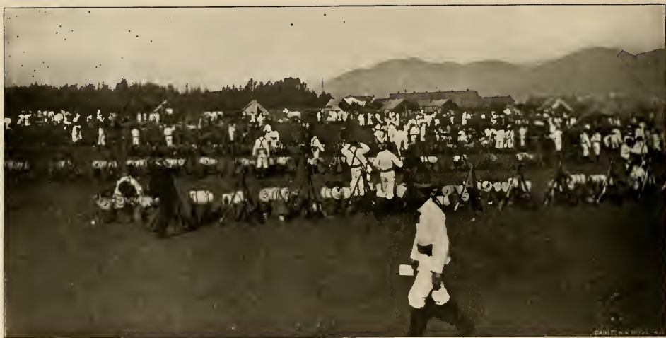
BREAKING CAMP AT THE PRESIDIO TO BOARD THE TRANSPORT.